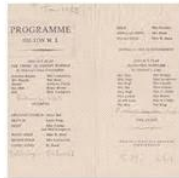
WI Scrapbook 1956-1984 Jun 14, 2009 photos: 1