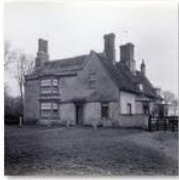
Buildings & Places Jul 4, 2009 photos: 287