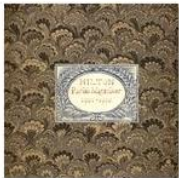
Hilton Parish Magazine (1901-1910) Jun 16, 2009 photos: 103