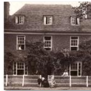
Manor House Jun 20, 2009 photos: 35