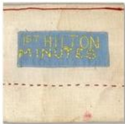
Scouts (1919) Jun 17, 2009 photos: 25