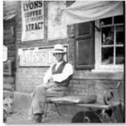
People Jul 6, 2009 photos: 292