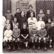
Village Hall-School Jun 28, 2009 photos: 46