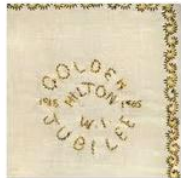
WI Scrapbook (1965) Jun 15, 2009 photos: 111