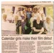
Calendar girls make their film debut WI Scrapbook 2002-2006