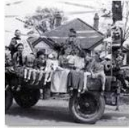
Celebrations Jul 2, 2009 photos: 185