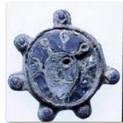
Archeology Jun 18, 2009 photos: 30