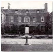
Hilton House Jun 26, 2009 photos: 147