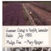
WI Scrapbook 1984-1990 Jun 13, 2009 photos: 1