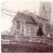
Church Jun 24, 2009 photos: 104