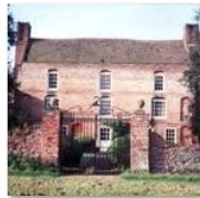
Hilton Hall Jun 22, 2009 photos: 94